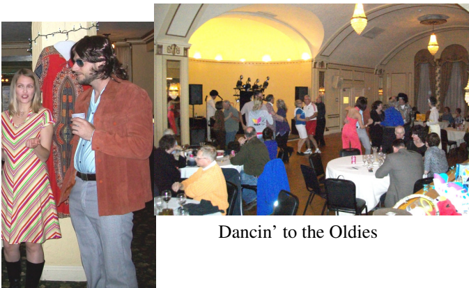
Dancin' to the Oldies