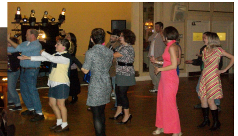
Doing the Macarena