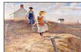
“After School” by Harvey Dunn