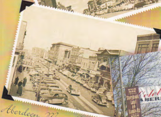
Aberdeen, Main Street, 1940