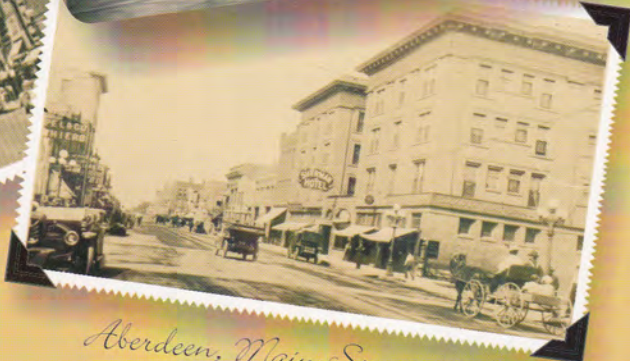
Aberdeen, Main Street, 1912