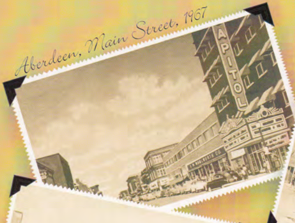
Aberdeen, Main Street, 1967