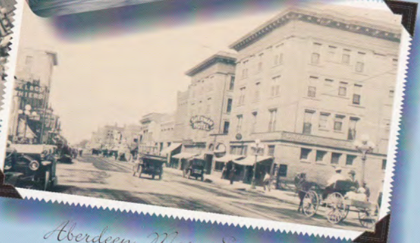
Aberdeen, Main Street, 1912