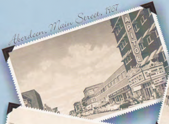
Aberdeen, Main Street, 1967