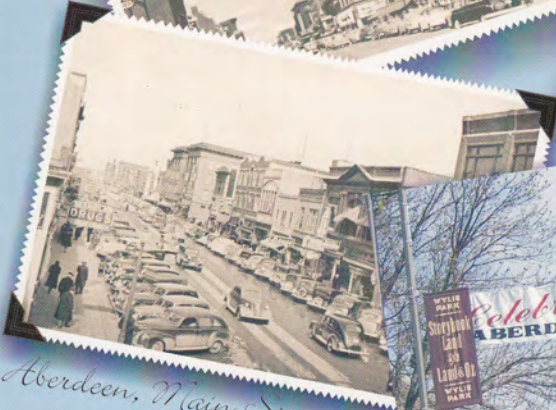
Aberdeen, Main Street, 1940

Celebrating A Great Hometown ABERDEEN'S 125th ANNIVERSARY, 2006